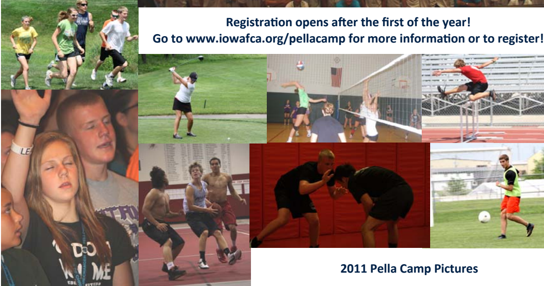
2011 Pella Camp Pictures

Registration opens after the first of the year! Go to www.iowafca.org/pellacamp for more information or to register!