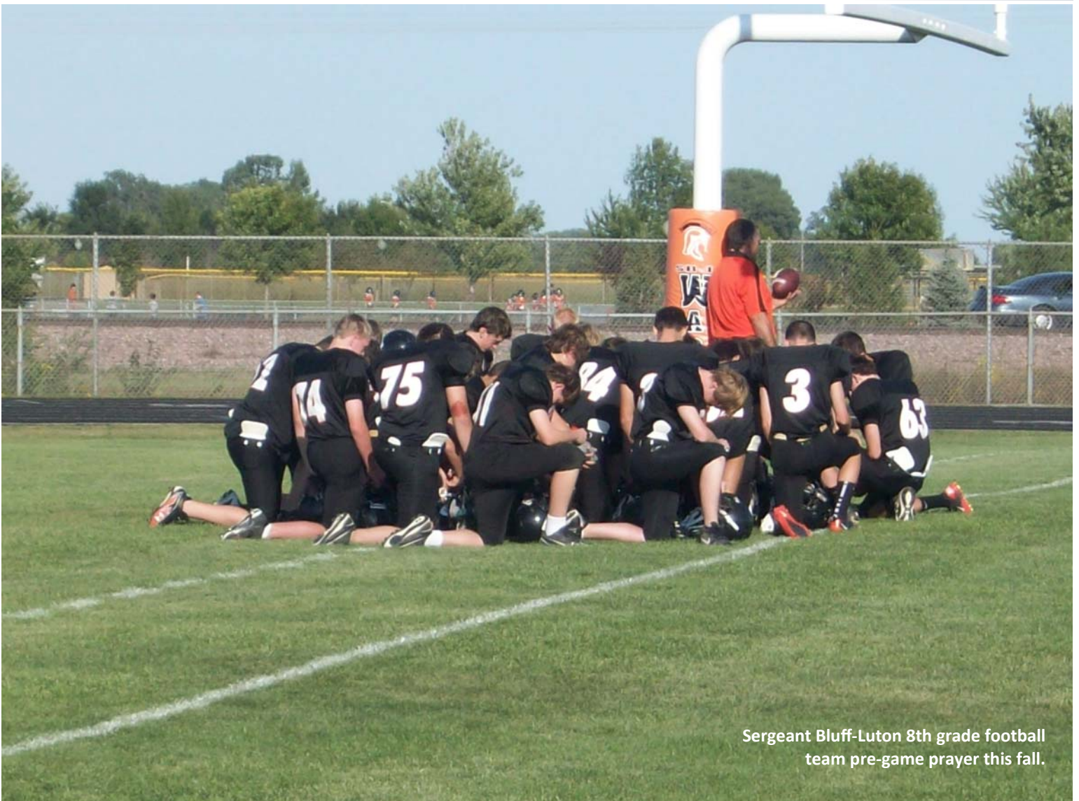
Sergeant Bluff-Luton 8th grade football team pre-game prayer this fall.

A PUBLICATION OF THE CENTRAL/WESTERN IOWA FELLOWSHIP OF CHRISTIAN ATHLETES